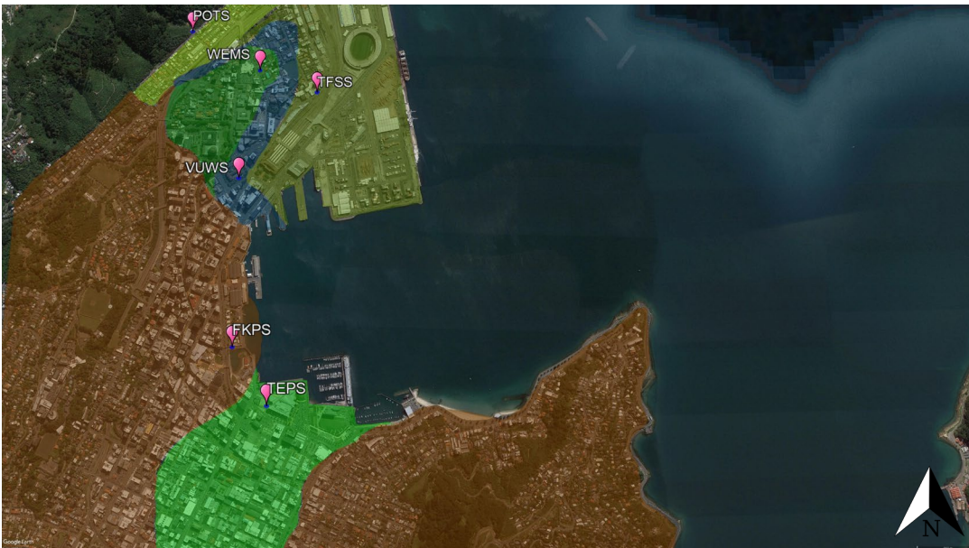
Figure 4: Central Wellington strong motion station boundaries.