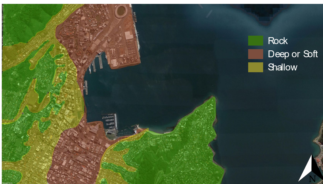
Figure 2: Site subsoil classes for central Wellington adopted from Kaiser et al. (2019).

The building period is essential for the evaluation of earthquake design action. Consequently, this research employs the analytical approach proposed in the Commentary of NZS1170.5 to estimate the approximate period of the building based on the height (NZS 1170.5 Supp1:2004 2004). Adding site subsoil class and building period to the database, the design acceleration of each building is calculated in accordance with NZS 1170.5 (2004) and added to the database for use in the framework.