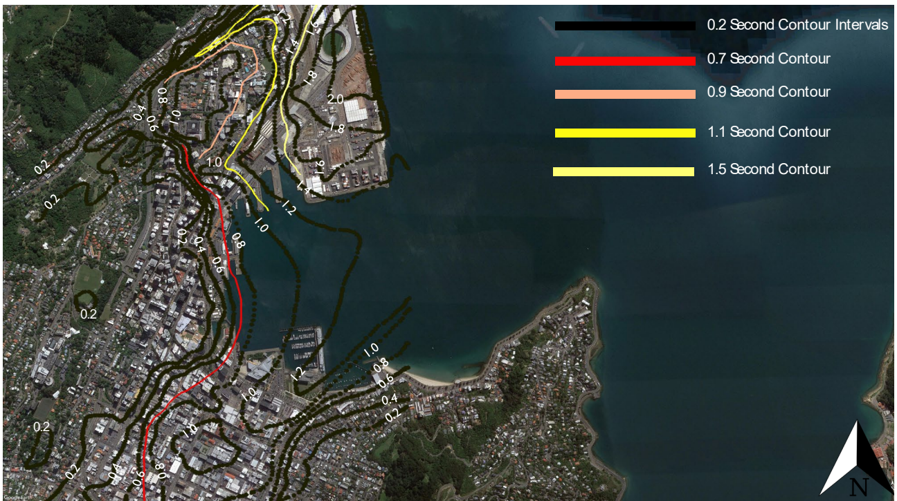
Figure 3: Central Wellington low amplitude natural period contours; black contours are in 0.2-second intervals, reported by Kaiser et al. (2019); corresponding site periods of colour contours are determined in the legend.