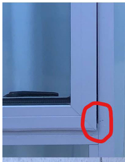
Figure 2: Air gap in corner of window due to residual drift of building

Residual drift of a building following an earthquake presents unique challenges for building restoration that need to be appreciated as part of post-earthquake assessment and repair strategy but is just as important to be considered as part of the original holistic design of the structure. As an example, an apartment building suffered earthquake damage that included a 0.5% residual drift. Unsurprisingly the windows were damaged and require full replacement, the solid plaster cladding was damaged and leaking and requires full replacement. If the new windows and cladding system are installed vertically, a future earthquake that causes the building to displace to 0.25% drift in the opposite direction would result in all original building components experiencing 0.25% drift, whereas the new windows and cladding system will experience 0.75% drift and almost certainly be damaged including the weathertightness. If the new windows were installed to align with the existing drift the install will likely damage the windows during the install and would leave gaps at the edges of the opening windows as exists presently, refer Figure 2.